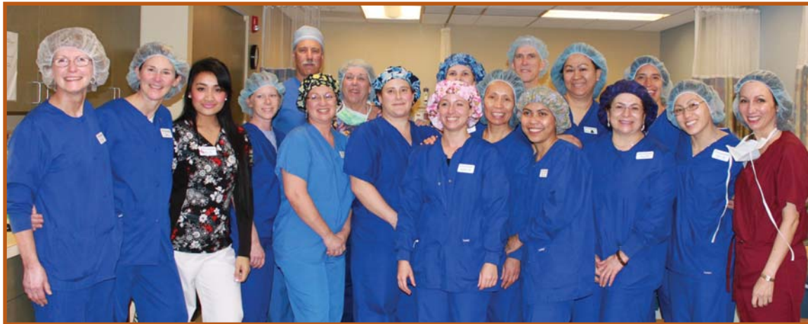
Eastside Surgery Center team and EHNW surgeons after first Mission Cataract Oregon event in April.